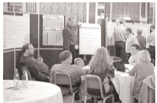
Plate 2: Process teams discuss their potential contribution to WWSC's objectives

Each process team then worked individually to develop a high-level process map (flow diagram) of their process, reflecting the responsibilities of the top-level QFD and the key interdependencies with other processes. Where it transpired that key inputs and outputs had been forgotten, members of each process team could discuss and agree these with other processes 'on the hoof'.