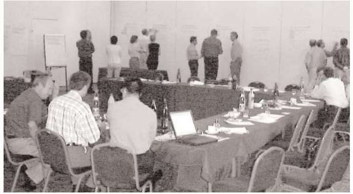
Plate 1: Developing and reconciling clear objectives for WWSC

discussed, and people move as they feel influenced by the arguments until consensus is reached. A proposed embellishment to the clothesline was to include benchmark data on cards and include them along the length of the line, but unfortunately the idea arose too late to benefit the WWSC discussions.