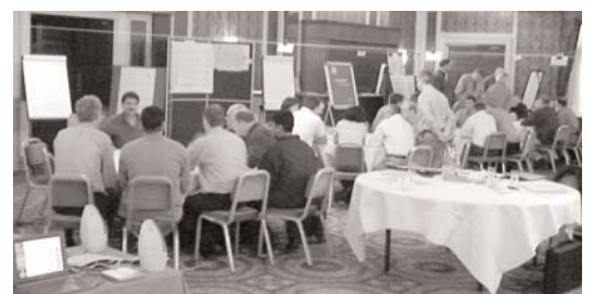
Plate 3: Process teams meet each other to agree interdependencies