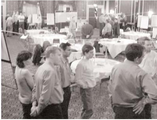
Plate 4: Process teams reach consensus on targets using the clothesline method

At this point, each process within WWSC had developed its own perspective on how the top level WWSC objectives and targets deployed down to responsibilities for their process. The steps to this ensured that the objectives were developed and owned by each process team, rather than imposed on them by management. This fostered a high level of creativity and commitment in pursuing those goals.